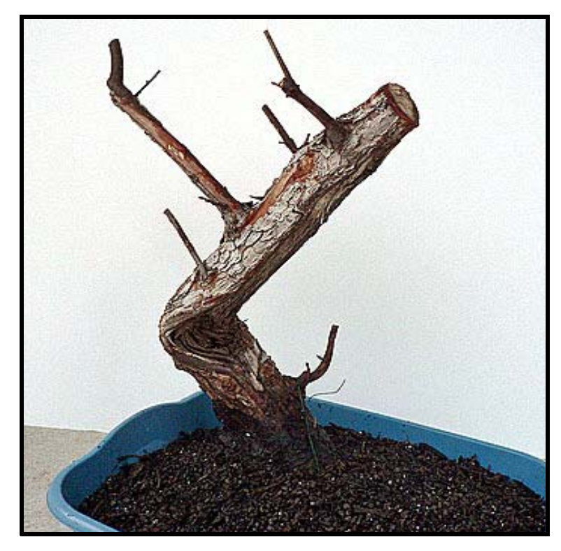
CEDAR ELM, CASCADE OR MOYOGI?