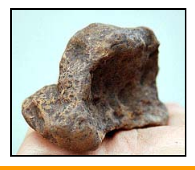
UNIQUE EXAMPLES OF SOME OF THE STONES COLLECTED. ABOVE, A MADONNA IMAGE?