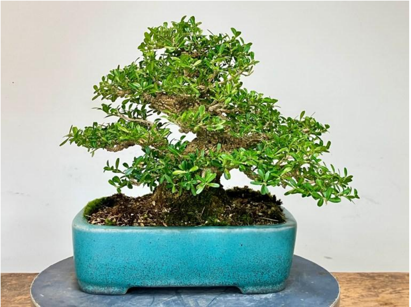
The back, at viewing height.