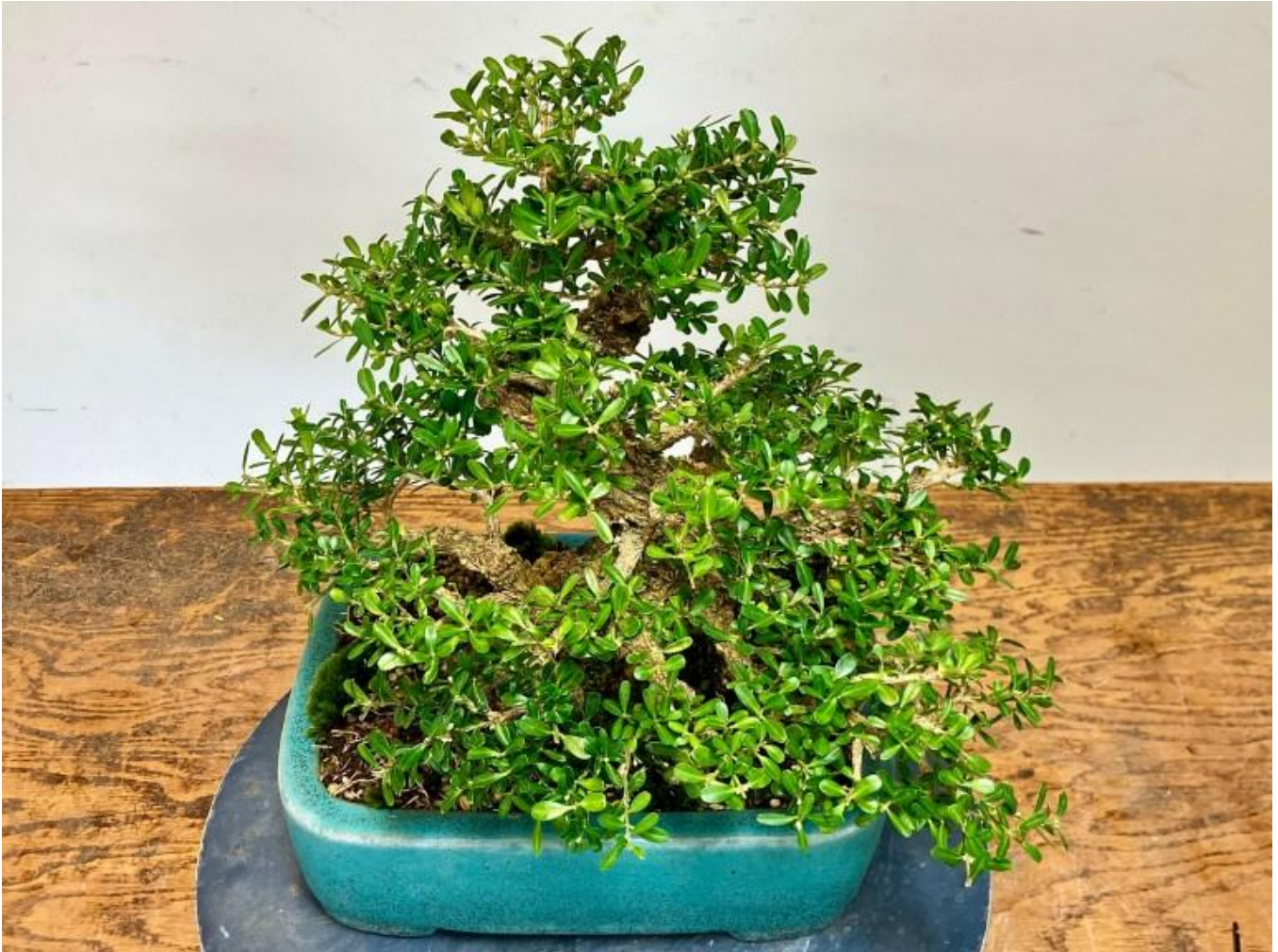
View from the top rear.