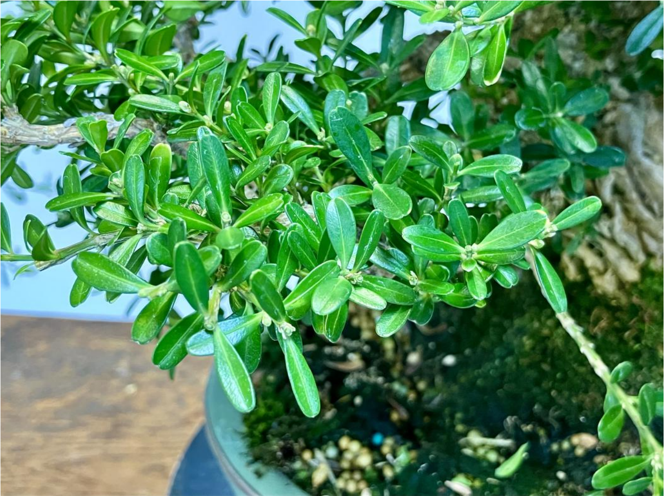
Branch pad after trimming.