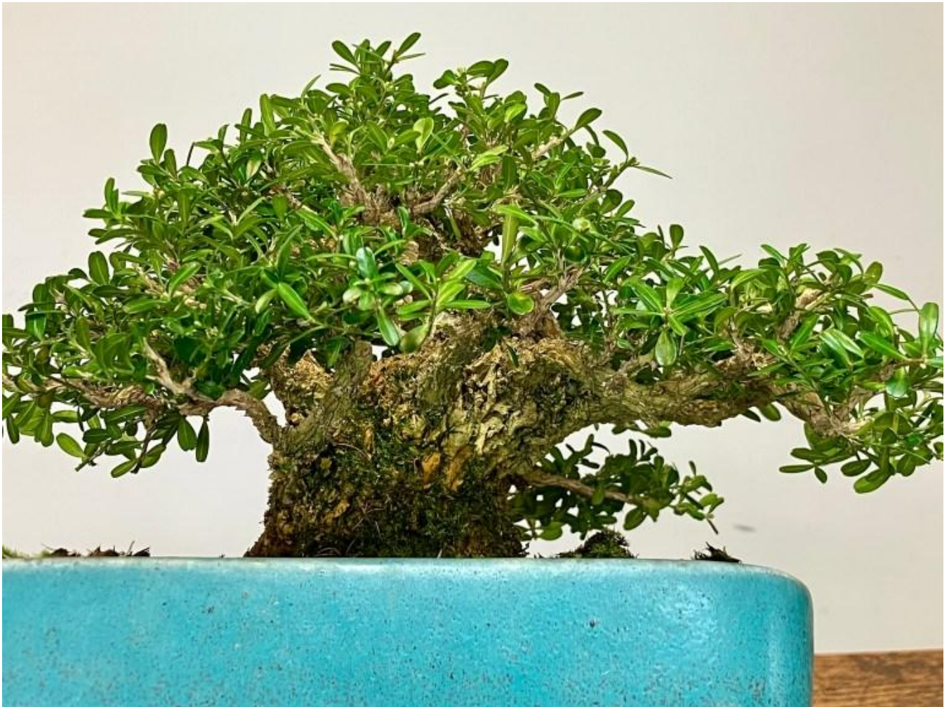
The back, looking up.