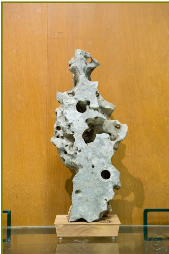
(Left) One of the unique rocks in Jimbo's rock collection