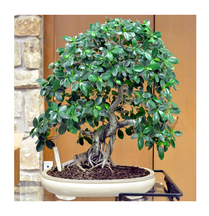
Spotlight of the Month

For additional information, please contact the Austin Bonsai Society at P.O. Box 340474, Austin, Texas 78734