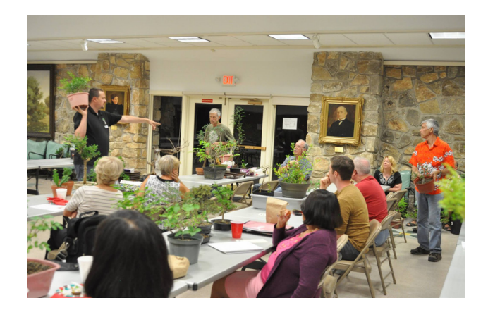
Auction from last last fall.

Oct 9/10: LSBF Bunjin Seminar in Kingwood, TX