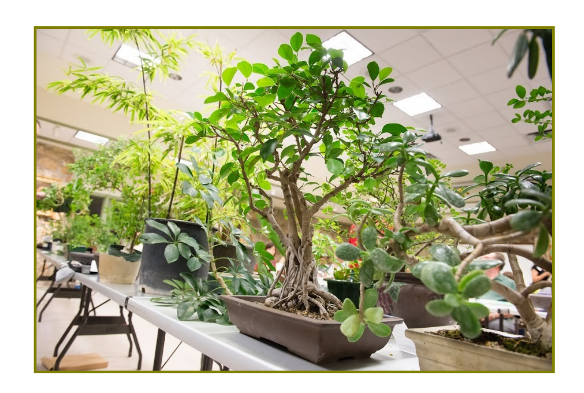
Some of the trees at the auction

The auction under way, led by Chuck Ware