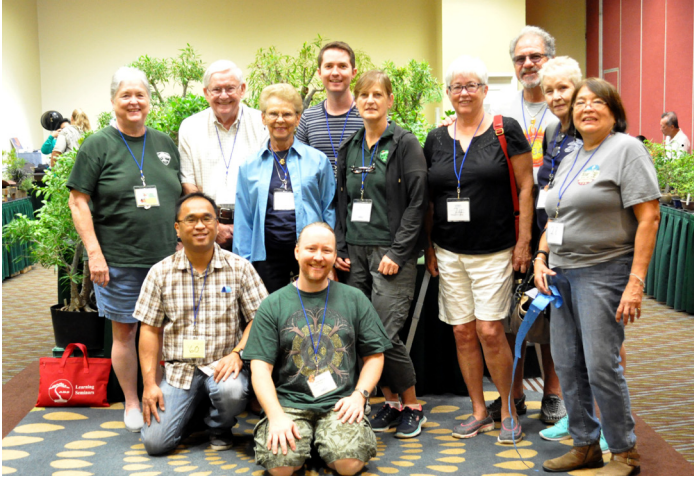
Austin members at the State Convention in Corpus Christi