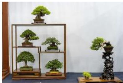
Image from the 5 th US National Bonsai Exhibition

The jewel of any bonsai convention or seminar is the Exhibition. This Exhibition will be for Shohin and Mame size bonsai trees only. We have space for 4 large shohin displays, several smaller displays, and spaces for 24-30 individual trees. Partner with someone else for multi-tree displays or enter a display as a club. The Exhibition will be advertised and open to the public . We want to thank the Fort Worth Bonsai Society for the use of their backdrops and felt table coverings.