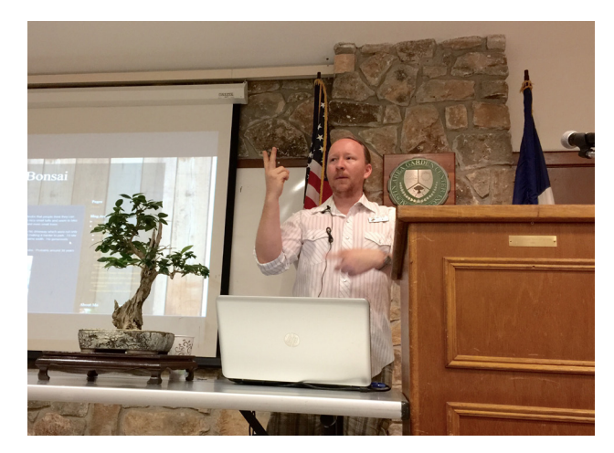
Zilker Garden Festival

Remember to sign up for the Owen Reich workshop on Tuesday, July 7th