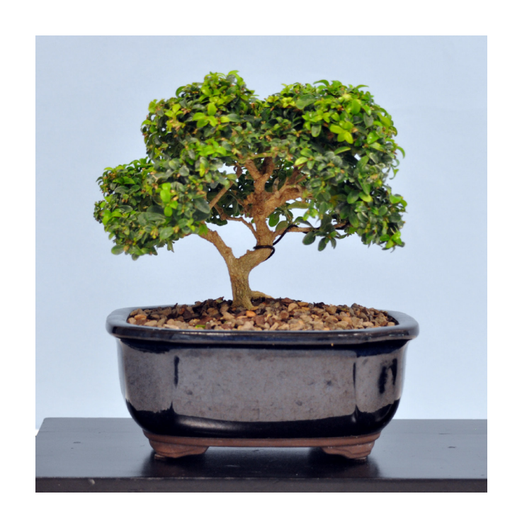
Spotlight of the Month

For additional information, please contact the Austin Bonsai Society at P.O. Box 340474, Austin, Texas 78734