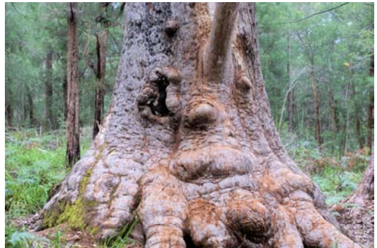
Looks like something out of Lord of the rings

Maybe not the "TALLEST" in the world but non the less impressive