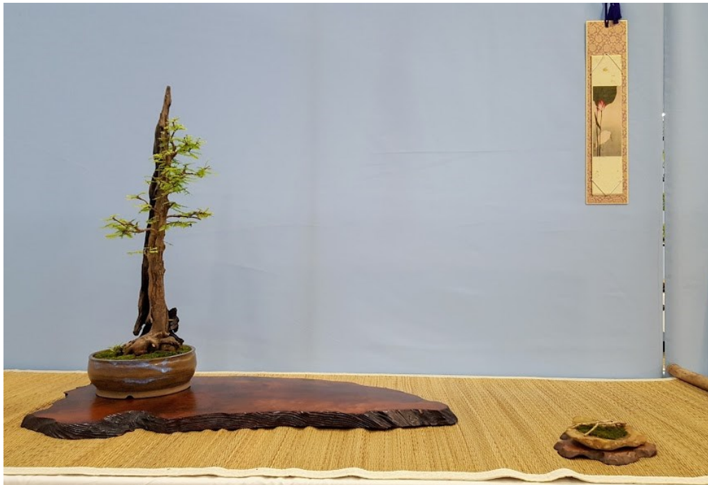
One of Joey McCoy's show trees (left) paired with a picture of the same tree in 2012 (above).