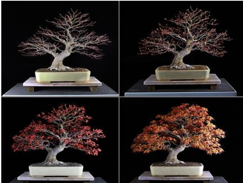
The 'Kashima' maple is basally dominant so lower areas must be kept in check to prevent the apex from weakening.