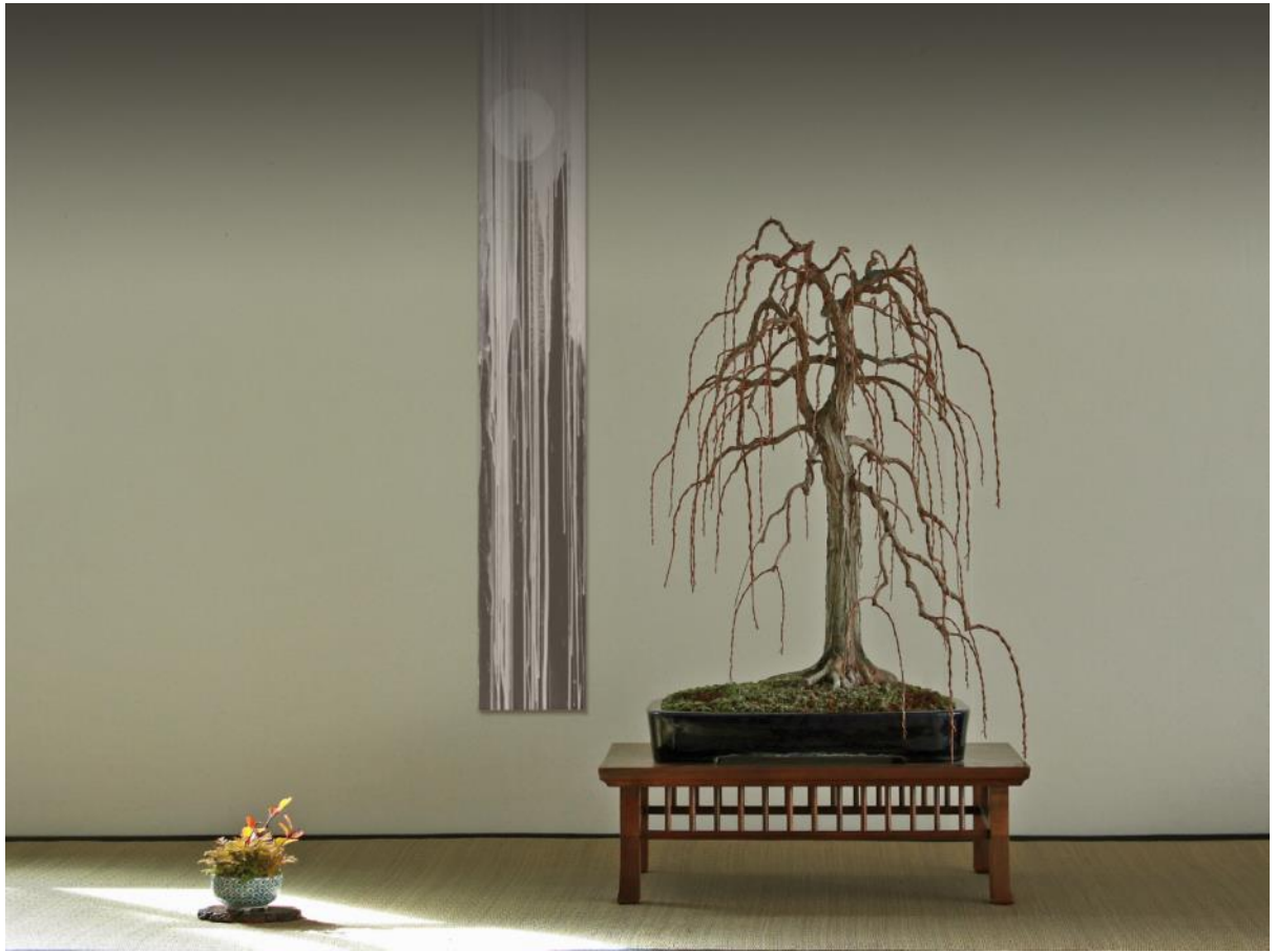
A stunning three-point display of this bald cypress.