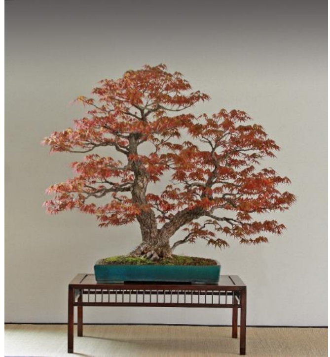
The Japanese maple 'Arakawa' has beautifully textured bark with brilliant spring and autumn color making this variety an exceptional choice for bonsai. This tree has appeared in International Bonsai Magazine issue# 3, 2020.

Unlike other art forms, bonsai is alive and constantly evolving which gives rise to an intimate and continued dialogue between the artist and nature. This relationship gives bonsai its own unique dimension for we must allow the tree to guide us as we strive to bring out its beauty and elegant form that teases you to pause with "Wait! I want to see that again!"