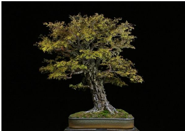
This yatsubusa elm stands 7" from soil level. Its most striking features include the incredibly fissured bark and tiny leaves which impart a very believable scale to the image it presents.