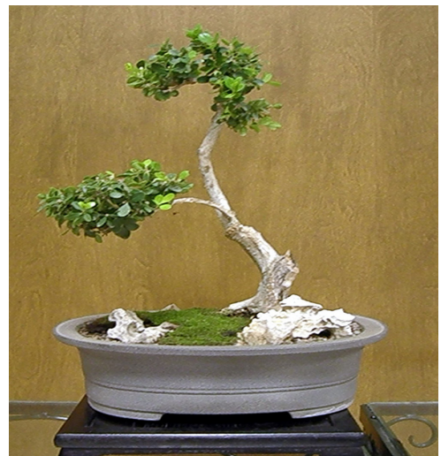
A Japanese Boxwood on display at April's monthly meeting reception.

I encourage every member to bring a tree for the club show. Unlike many bonsai exhibits this one is not judged and is really a public celebration of our art. Like some hidden concubine, many of the finest trees in the club are never seen outside of their own garden. The joy of art is sharing, not comparing. If you have trees that you are proud of, that you wish to share, please bring them to the club show.