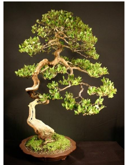
This bonsai was recently reported stolen from Florida. For more information please see www.bonsai-bsf.com .