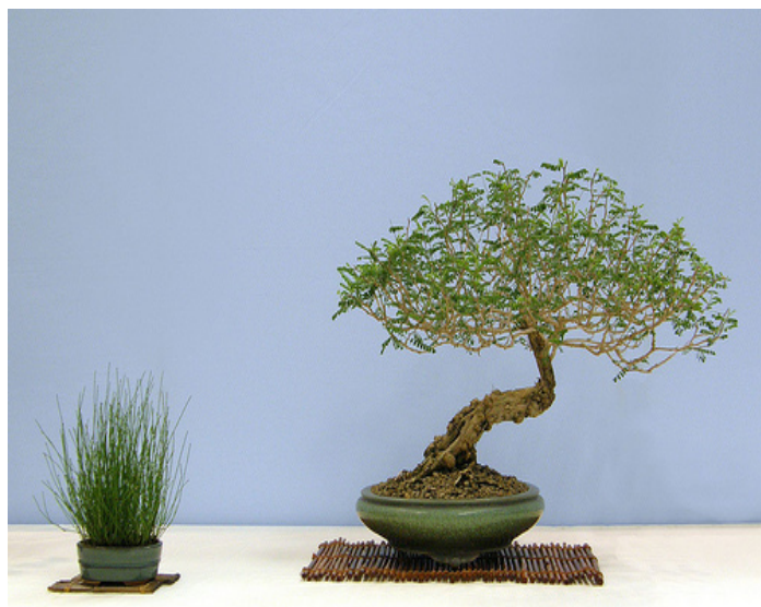
Eysenhardtia texana (Kidneywood)