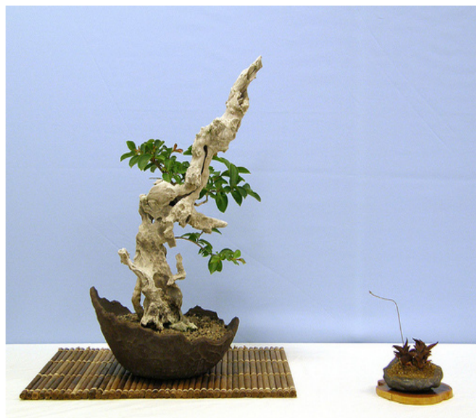
Lagerstroemia indica Tanuki (Phoenix graft)