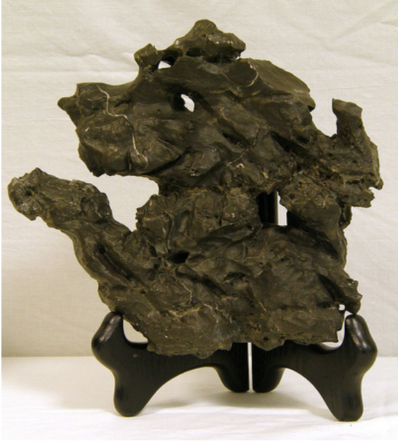
Suiseki poodle shape