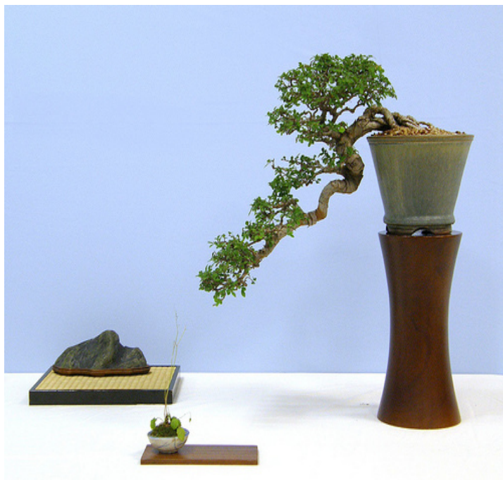
Ulmus parvifolia 'Catlin'