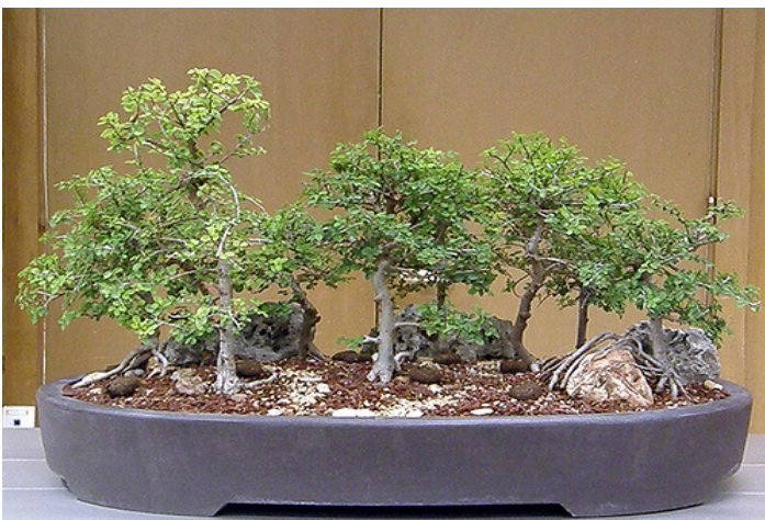
An Elm forest on display during the May Member's Workshop

On Tuesday, May 17th we will have an open Bonsai workshop . Being so close to the Seminar in San Antonio, we won't be having a visiting artist. Bring any tree to the meeting you'd like to trim, wire, or style, or get another person's opinion on and you'll have fellow Bonsai artists give you their take. It's about the right time for repotting Tropicals as well, so if you'd like assistance, bring along your tree. Please bring any tools and supplies you'll need for your project, table covers will be provided.