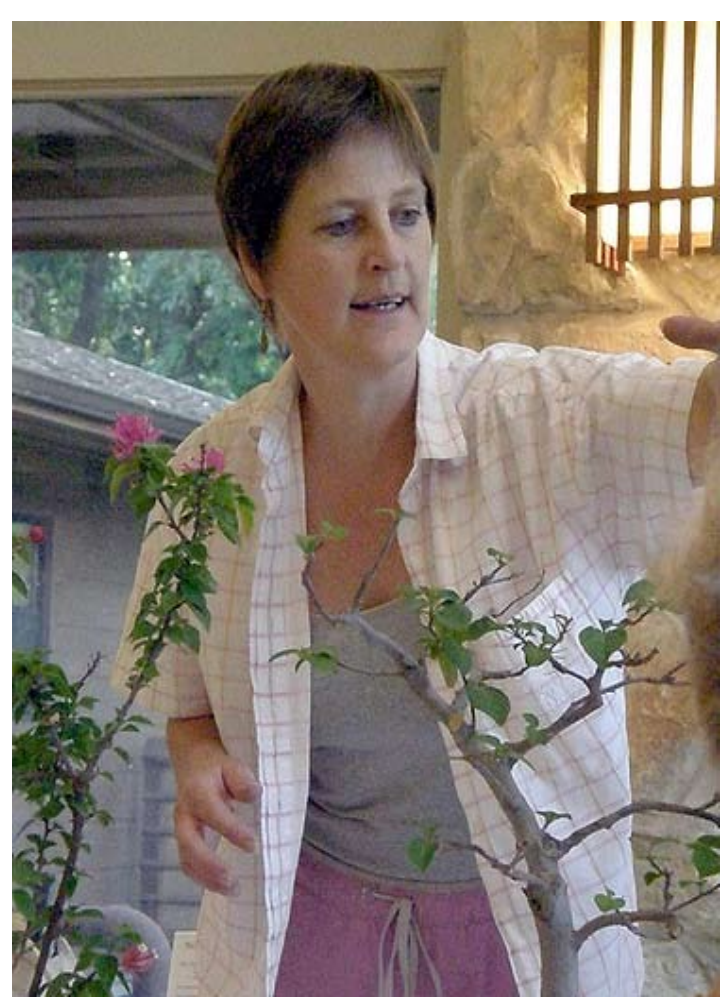
Els gave advice on bougainvilleas brought in by members during June's workshop