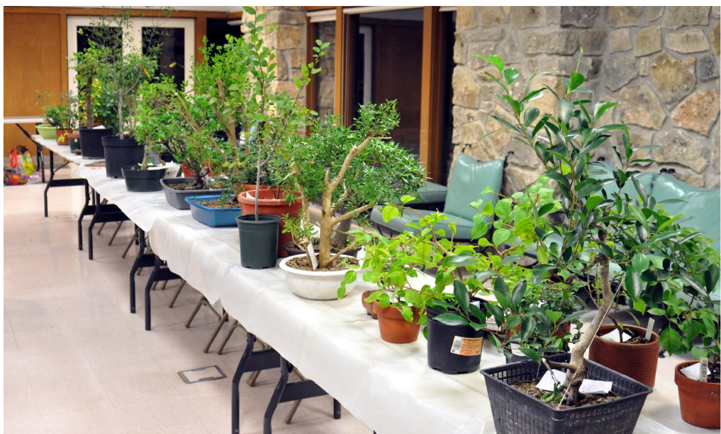
Many plants were available at November's auction