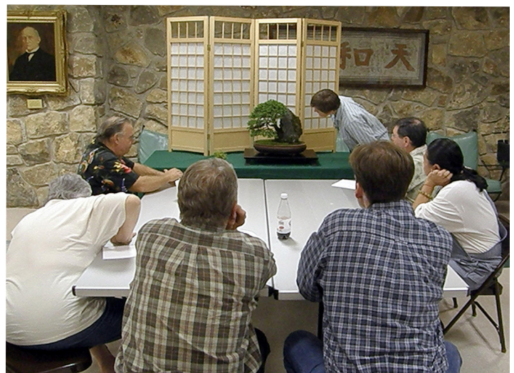
Members contemplating a bonsai during November's Monthly Meeting.

There is no Monthly Meeting, Member's Workshop, or Board Meeting this month.