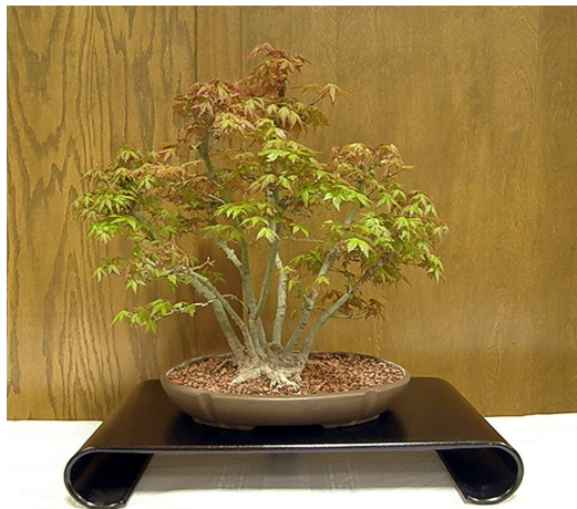
A Japanese Maple on display during the March Monthly Meeting Reception

It may seem a while away, but our May show is coming up on us very soon. On Tuesday, April 15th , Jim Trahan will lead the group in a discussion about preparations to show our trees . Please bring in trees, stands, accent plants, etc., you'd like to exhibit, and