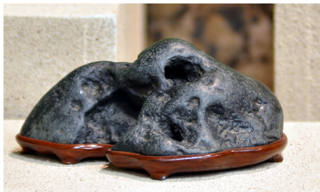
Suiseki at State Convention

The annual auction is the main funding for our club. Nothing else during the year provides the funds for our artist lecture/demos and workshops as much as this event. Let's up the ante on the bids and think more about what we are doing for the club than what we are gaining. It doesn't hurt to have nicer trees/pots/tool/etc. to offer more money for. When you are picking out trees to donate to the auction don't just grab the inferior ones that you're tired of dealing with. Consider some of your higher quality bonsai! Think of the possibilities if we all did this. An auction of valuable trees where we all walk away happy!