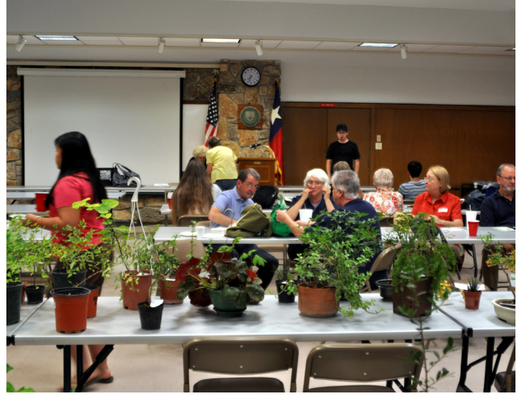
September 2011 Workshop