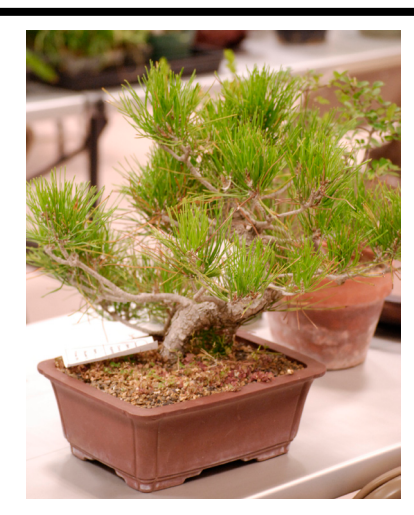
Donated Item at the Annual Auction

As time went by and I became more aware of the inner workings of this club, I grew to appreciate what time and devotion goes into making it happen. It truly takes a village to raise a child (or in this case a club) and teamwork means everything. With that in mind, I feel that I have been remiss in showing my appreciation to the fellow members of the board and to the members of the club who have consistently gone above and beyond the call of duty. We all have our regular lives including family and jobs as well as our own bonsai to attend to. Taking the time out from that to further the education of this art to new people, as well as making this a fun and functional club, are key to keeping this club alive. My heartfelt thanks go out to all of you!