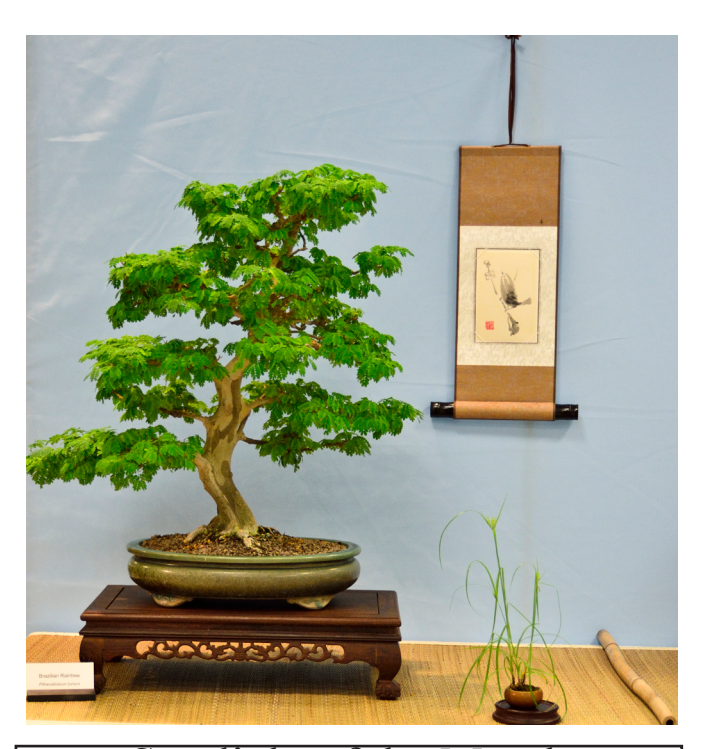
Spotlight of the Month

For additional information, please contact the Austin Bonsai Society at P.O. Box 340474, Austin, Texas 78734