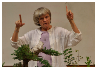
October 2011 Phoenix Grafts