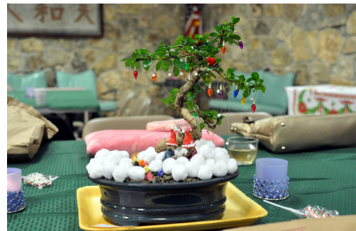
Decorated Tree at Christmas Party

But most importantly, Happy New Year everyone!