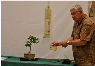
May 2011 Formal Displays