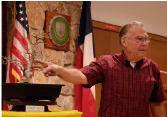
January 2011 When and Why's