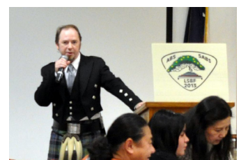
December 2011 Christmas Party