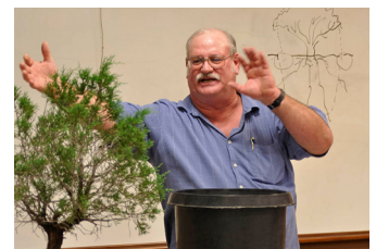
August 2011 Collecting Trees