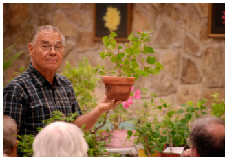
September 2011 Annual Auction