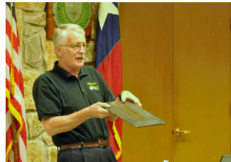
March 2011 Sharpening Tools