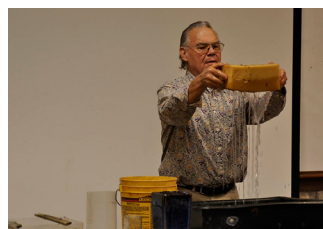
November 2011 Container Soil