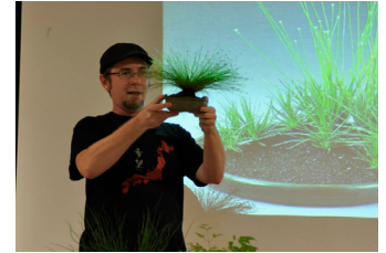
April 2011 Accent Plants