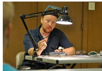
July 2011 Maintaining Tools