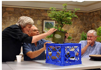
June 2011 3 Person Critique