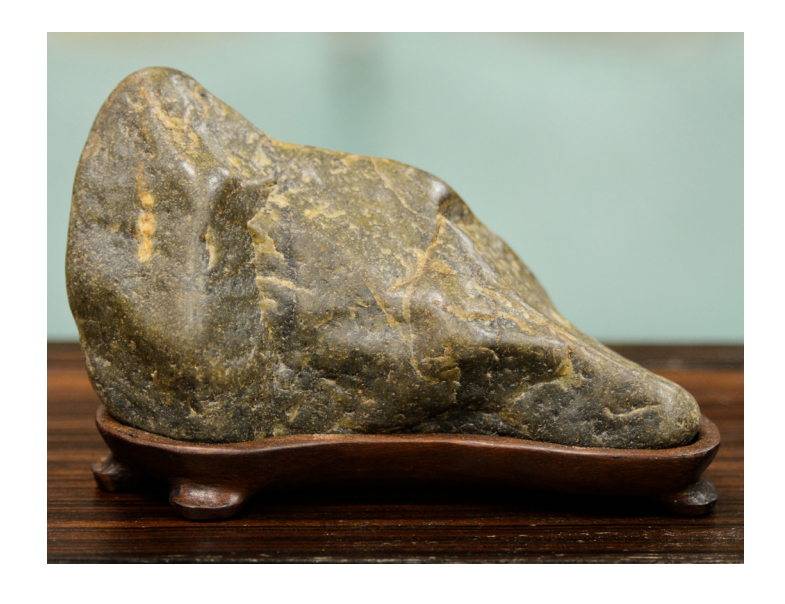
Spot Light of the Month Editor's Choice

For additional information, please contact the Austin Bonsai Society at P.O. Box 340474, Austin, Texas 78734