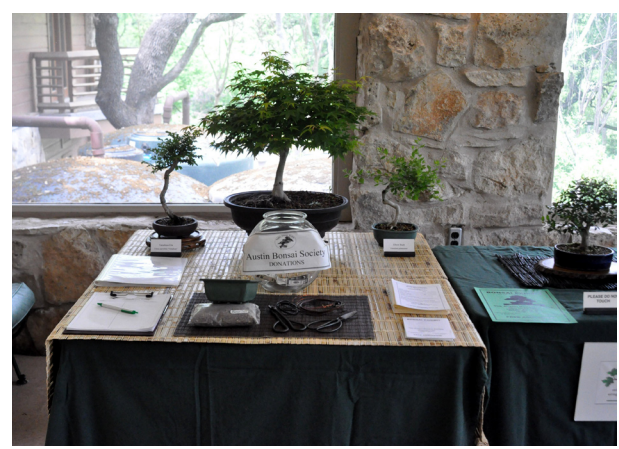
March 2012 ABS Multi-Tree Workshop