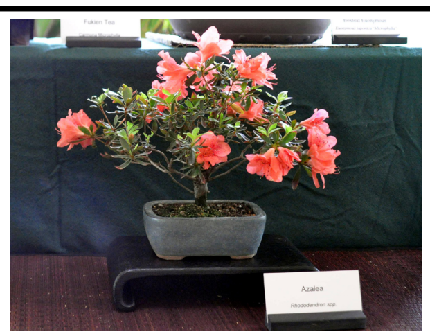
Shown at the Garden Festival & Flower Show

Don't forget about donating stuff for the raffles for our convention next year. THIS MEANS YOU! It's going to be here sooner than you think and we're going to look foolish if there's nothing to raffle! Bring your items (remember, they don't have to be bonsai related) to the regular meetings. We also need large coffee containers for the raffle tickets.