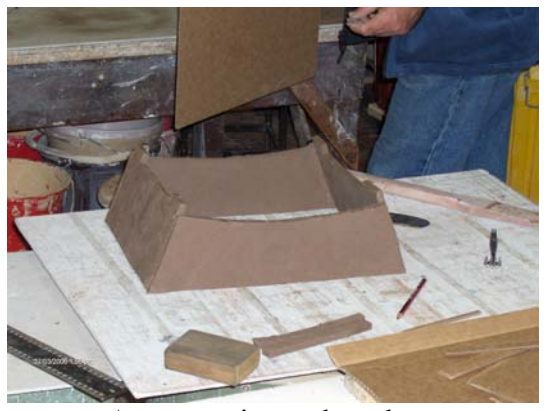
A masterpiece takes shape