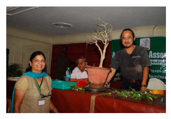
Some candid shots of the event in India are shown above