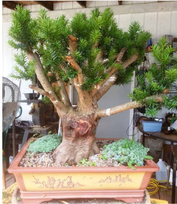
Japanese Yew- Before Styling