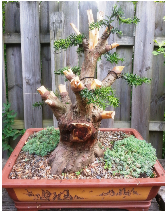
Japanese Yew – After Styling