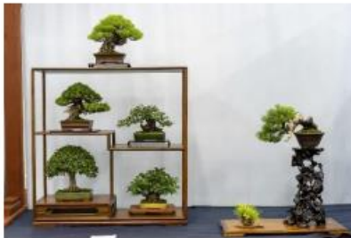
Image from the 5 th US National Bonsai Exhibition

The jewel of any bonsai convention or seminar is the Exhibition. This Exhibition will be for Shohin and Mame size bonsai trees only. We have space for 4 large shohin displays, several smaller displays, and spaces for 24-30 individual trees. Partner with someone else for multi-tree displays or enter a display as a club. The Exhibition will be advertised and open to the public . We want to thank the Fort Worth Bonsai Society for the use of their backdrops and felt table coverings.