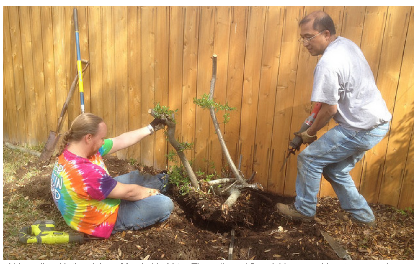
Urban dig with the club on March 16, 2014. The collected Dwark Yaupons, Ligustrums, and more.