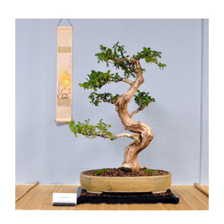
Spotlight of the Month

For additional information, please contact the Austin Bonsai Society at P.O. Box 340474, Austin, Texas 78734